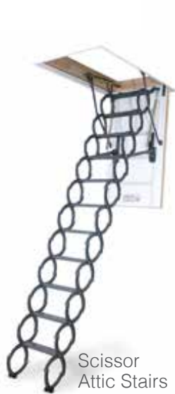
Scissor Attic Stairs