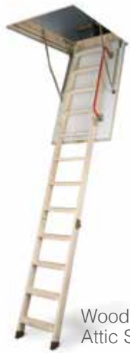
Wooden Attic Stairs

Otago Skylights & Heating proudly offer a range of healthy home solutions & services.